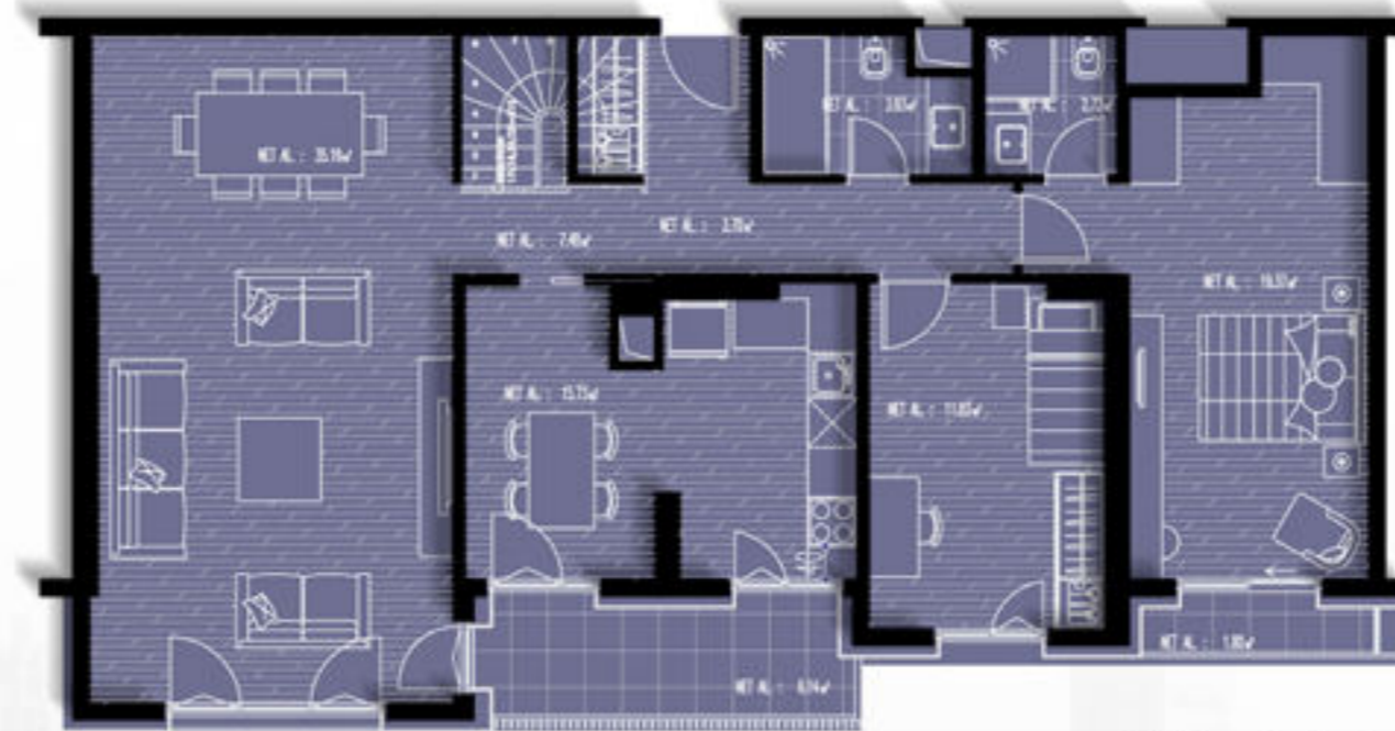
A Block 4+1_G G. Floor