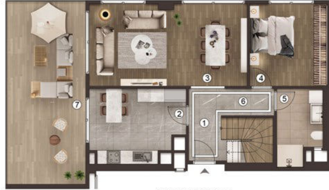
DUBLEKS ALT KAT PLANI