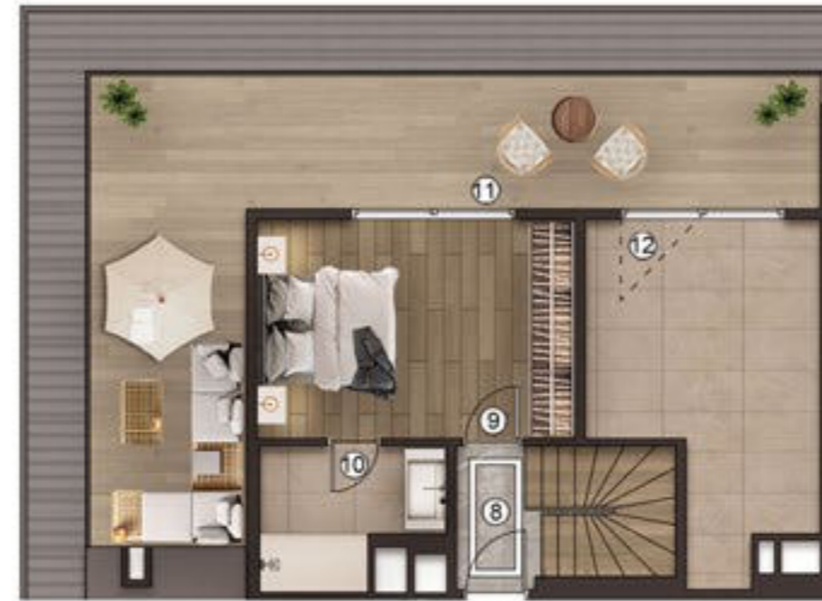
DUBLEKS ÜST KAT PLANI