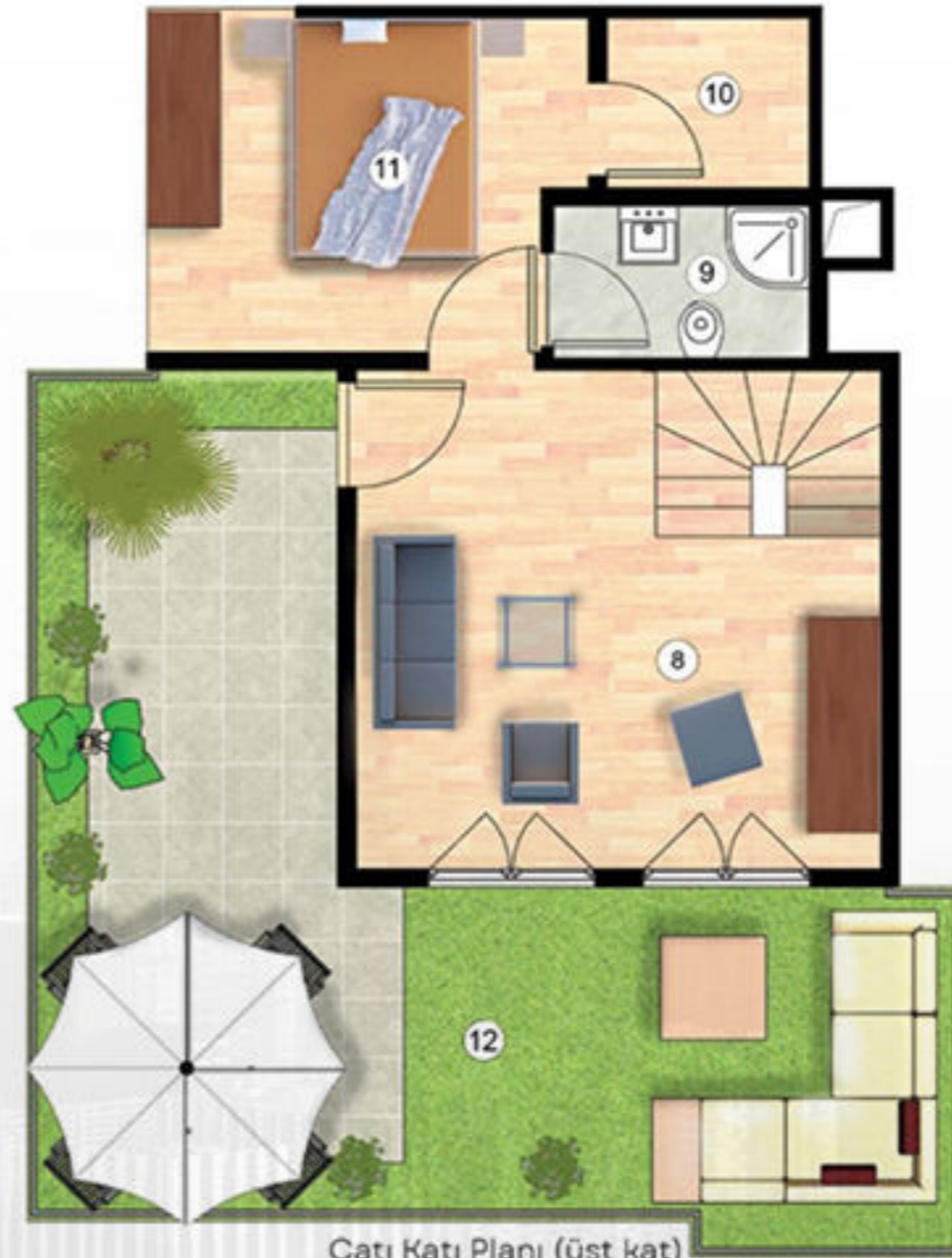
Çatı Katı Planı (üst kat) Roof Floor Plan (upstairs)